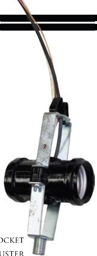
▶P25, TWIN, SNAP-IN SOCKET P27, 3-LIGHT SOCKET CLUSTER