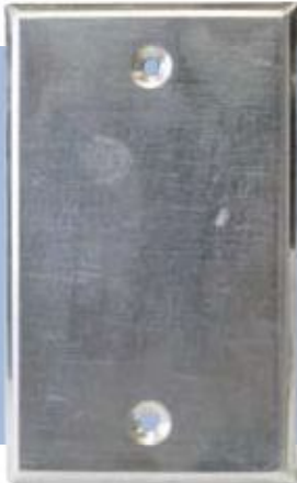
▼P230, 2.75" X 4.5" ELECTRICAL PLATE COVER