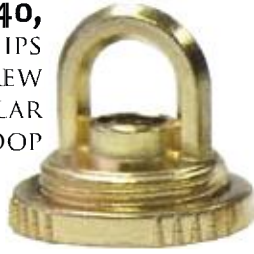
▶P40, 1/8" IPS SCREW COLLAR LOOP