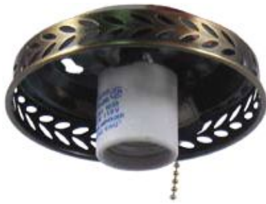
▲H101-ab, 4" FAN FITTER H102, 3.25" FAN FITTER