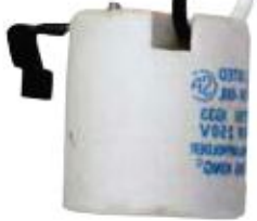
▶P28, SINGLE-PIN SNAP-IN E-27 SOCKET