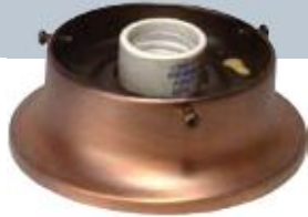
◀H103-cp, 3.25" FLUSH MOUNT FITTER