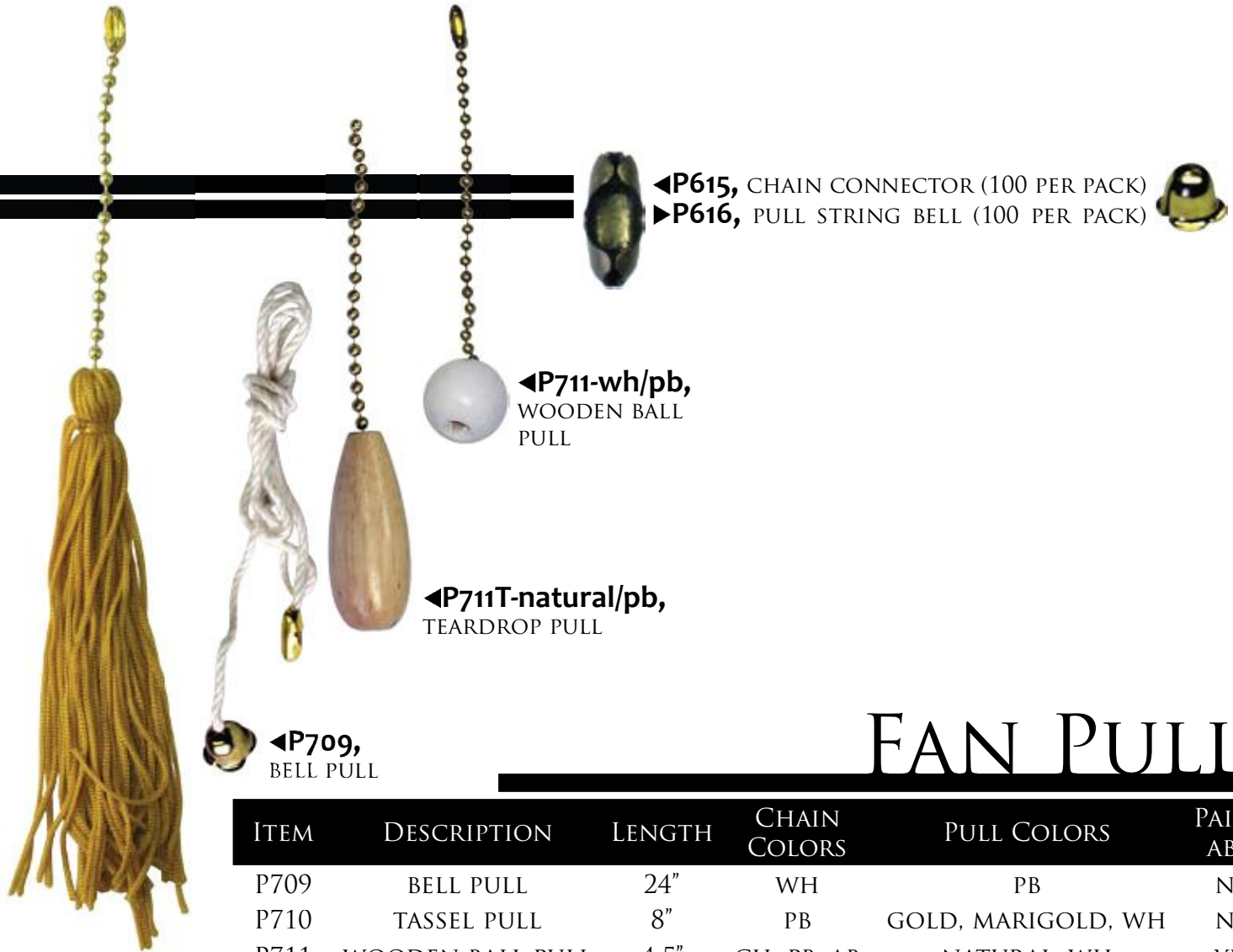
▲P710-gold/pb, TASSEL PULL