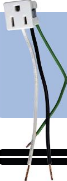
▼P509, 125V 15A CONVENIENT OUTLET