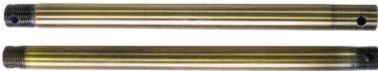
DOWN RODS AVAILABLE FINISH: AB, PB, WH; PAINTABLE