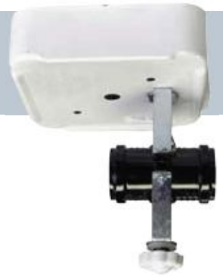
H240, 4-LIGHT RECTANGLE BEDROOM FITTER