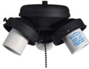
▲H301-blk, 3-LIGHT CLUSTER FAN FITTER H402, 4-LIGHT CLUSTER FAN FITTER