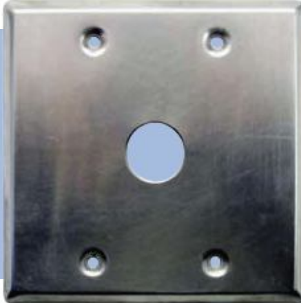
▼P231, 4" X 4.5" ELECTRICAL PLATE COVER