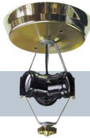
▼H203-pb, 3-LIGHT ROUND BEDROOM FITTER