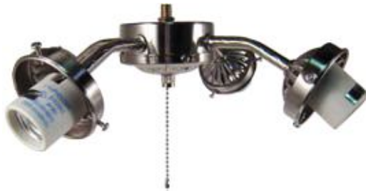
▲H401-bn, 4-LIGHT FAN FITTER