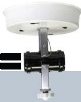
▼H201-wh, 2-LIGHT ROUND BEDROOM FITTER