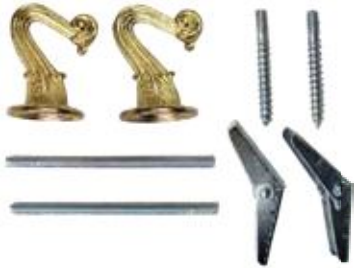
▲P30, SWAG HOOK KIT

finish: AB PB WH; PAINTABLE · finish: AB PB WH; PAINTABLE