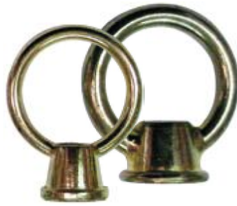
◀P44, 1/8" X 1" FEMALE LOOP