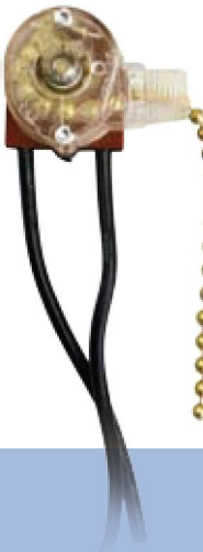
◀P210, ON & OFF SWITCH P280, 5 TO 8 WIRE FAN SWITCH P280A, 4-WIRE FAN SWITCH