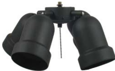
▲H410-blk, 4-LIGHT BULLET FAN FITTER