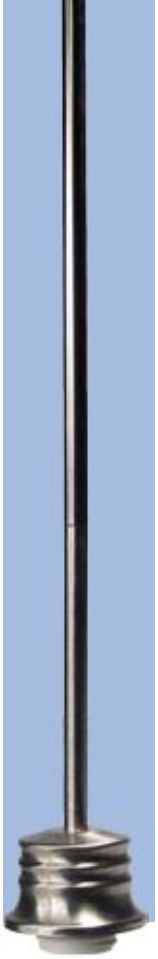
▲H2576-bn, ADJUSTABLE PENDANT ROD H2578, ADJUSTABLE PENDANT ROD WITH CHAIN